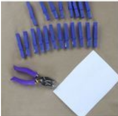
Use hole punch to cut out stars