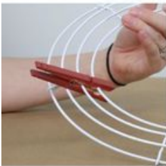
Put 1st red clothespin on 3rd & 4th rings