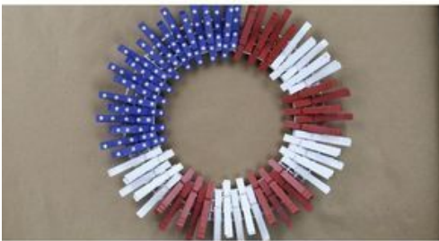
Alternate between 5 red & white clothespins. Finish with blue clothespins.