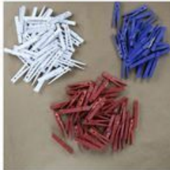
Spray paint clothespins red, white & blue