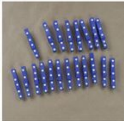
Glue stars to blue clothespins