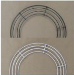
Spray paint a green wire wreath white