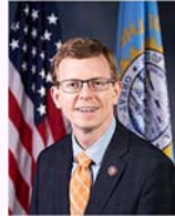
Representative Dusty Johnson Washington D.C. Office 202-225-2801